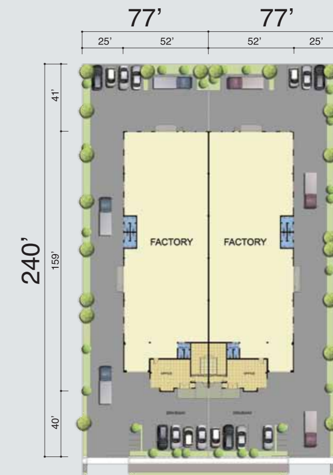
GROUND FLOOR 底层