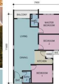
Type C2 Corner